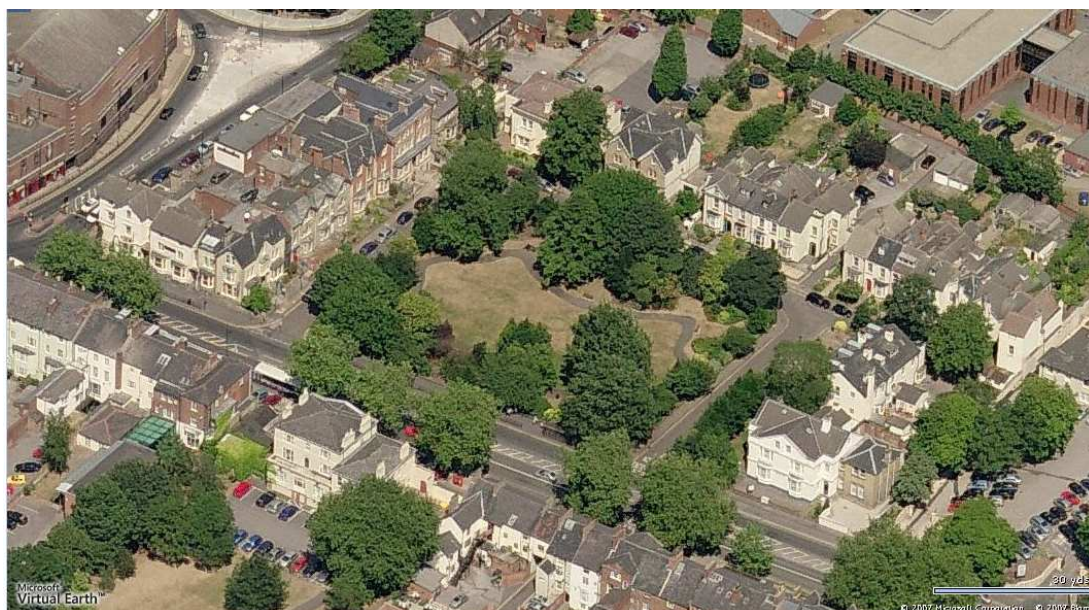
Figure 1: Regent's Square, Doncaster. A mid 19 th century 'Garden Square'.

The built character of the area varies across the zone. The earliest area of development was constructed along South Parade before 1851, essentially as ribbon development, and consists of large terraced townhouses, generally of 3 storeys and now generally in commercial use. Accompanying these terraces is Regent's Square (Figure 1) laid out in the early 1850s (Doncaster