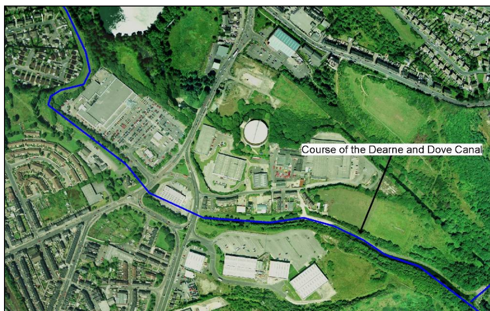
Figure 2: Former course of the Dearne and Dove Canal (in blue) as it runs through Old Mill in Barnsley, where former industrial sites have been replaced with modern retail developments.

The positioning of former industrial sites will have been partially influenced by the availability of flat land along the Dearne valley but transportation links will have played a significant part in the development of the area. The Dearne and Dove Canal, which runs through this area, was fully opened in 1804, connecting with the Barnsley Canal and the Don Navigation (Glister 1995, 118). Parts of the canal system were falling out of use from the 1920s but final abandonment only came in 1961 (ibid, 120-22). Although the canal has been infilled in places, the course is often fossilised by property boundaries. Within this zone the canal can be seen within 'Old Mill Retail Parks', 'Stairfoot Post Industrial Area', 'Wombwell Business Parks North', 'Wombwell Park', and 'Worsbrough Canal Basin'.